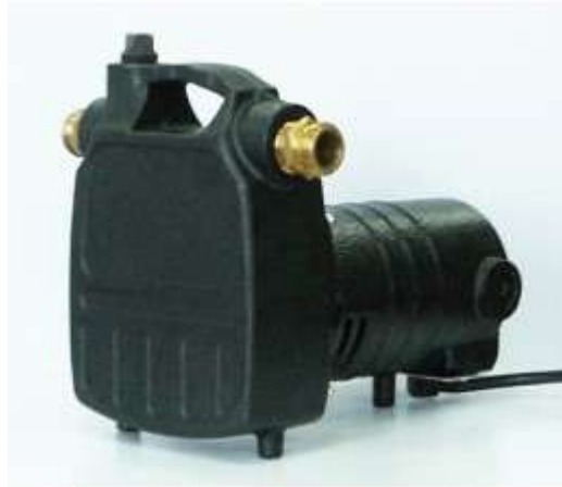
CPACE – 1/2HP TRANSFER PUMP