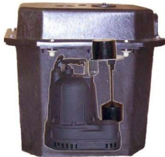
CP3VLT – LAUNDRY TRAY PUMP